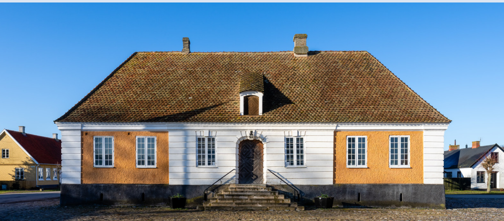
Skanör's Town Hall